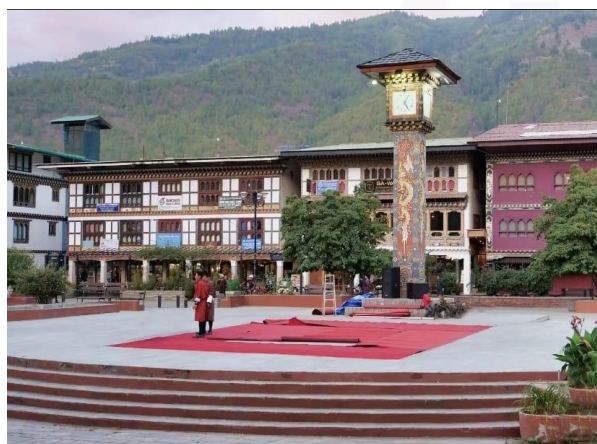
The Clock Tower Square ( Venue of the Championships)