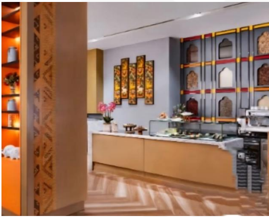
The Deli & Cake Shop