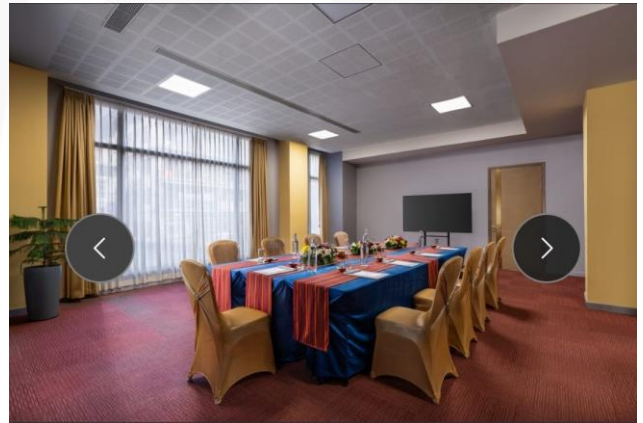
The Meeting Room