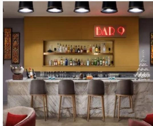
Bar 9 Lobby