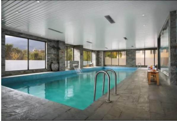
Indoor Swimming pool

30TH JUNE - 4TH JULY, 2026 - THIMPHU, KINGDOM OF BHUTAN.