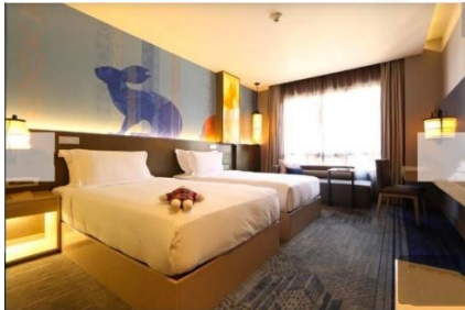
Superior Room Twin