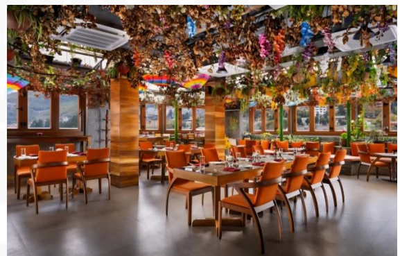
The Garden Restaurant